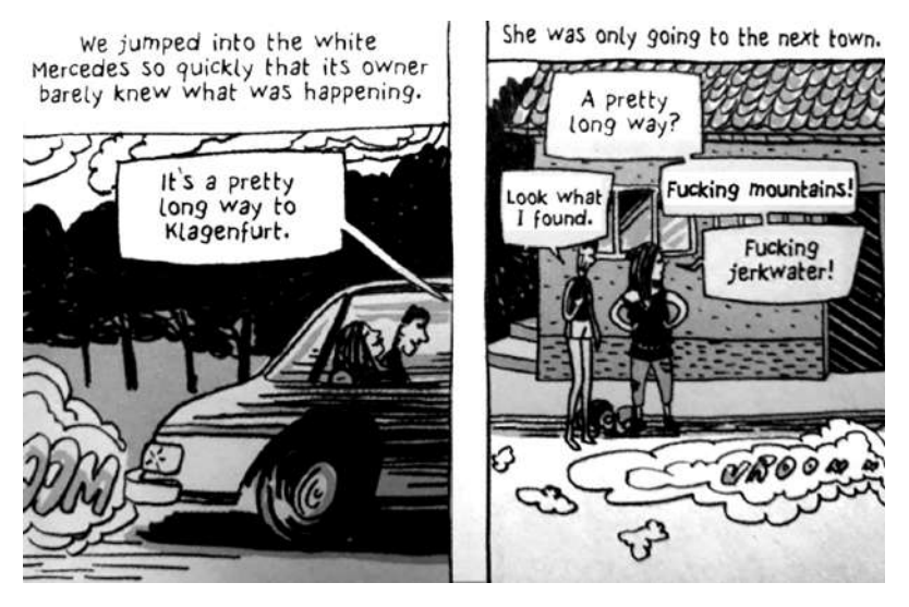
Figure 6: Example of visual compensation (compensation of omission of Manner in the ∏) © 2009 Ulli Lust

Finally, it should be noted that the translation technique of specification proposed by Molés-Cases (2020) was not found in any of the subcorpora studied. Like the lack of cases of addition, this is unsurprising, given the typological combinations studied (SFL>VFL and SFL>SFL).