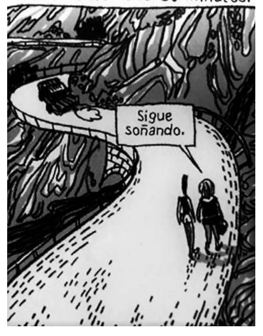
Figure 4: Example of visual compensation (compensation of omission of Manner in the TT) © 2009 Ulli Lust

Nos pasaba un coche aproximadamente cada 30 minutos.