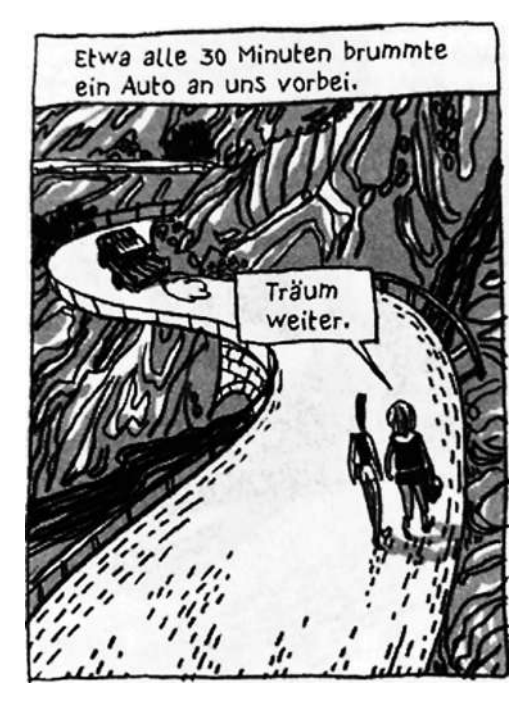
Figure 3: Motion expressed both linguistically (Etwa alle 30 Minuten brummte ein Auto an uns vorbei) and graphically © 2009 Ulli Lust

As regards linguistic expression of motion, Talmy (1985, 2000) classifies the world's languages based on how they encode the semantic component of Path: satellite-framed languages (SFL), such as English and German, typically encode Path in a satellite and Manner in the verb (e.g. Daniel humpelte ins Haus); verbframed languages (VFL), such as Spanish and French, usually encode Path in the verb and Manner in adjuncts if necessary (e.g. Daniel entró en la casa cojeando 'Daniel entered the house limping'). Inspired by this classification, Slobin (1987, 1996a) presented the Thinking-for-speaking hypothesis, "a special kind of thinking that is intimately tied to language — namely, the thinking that is carried out, online, in the process of speaking" (Slobin 1991:11). According to this hypothesis, speakers of different languages conceptualize reality differently, since they pay different amounts of attention to the characteristics of objects and events (for example: native speakers of SFL devote more attention to Manner, while speakers of VFL focus mostly on Path). The application of Thinking-for-speaking to the study of the translation process gave rise to the Thinking-for-translating hypothesis (Slobin 1997, 2000), according to which translators tend to distance themselves from the source text in order to conform to the rhetorical style of the target