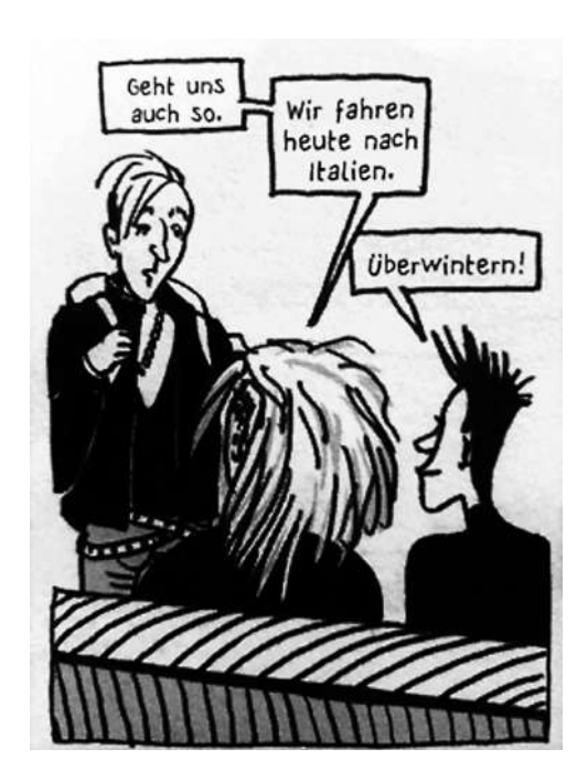
Figure 1: Motion expressed linguistically (Wir fahren heute nach Italien), but not graphically © 2009 Ulli Lust